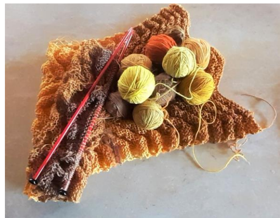
And later.... being crafted into a new creation!