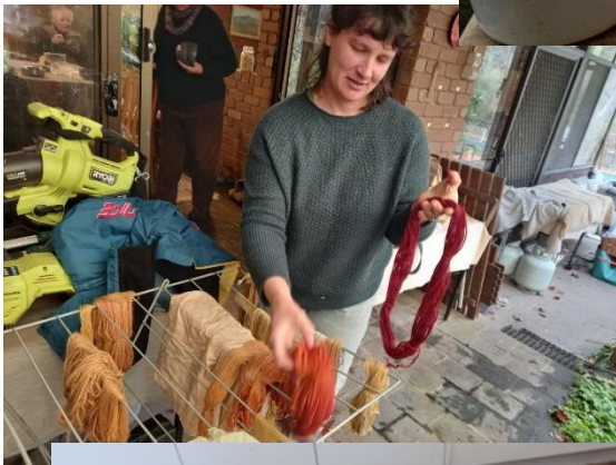
Hanging our skeins of coloured wool up to dry.